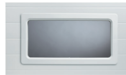
24" X 12" INSULATED GLASS Available with either a black or white frame.