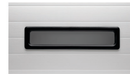
24" X 6" DOUBLE INSULATED ACRYLIC WINDOWS WITH BLACK FRAME